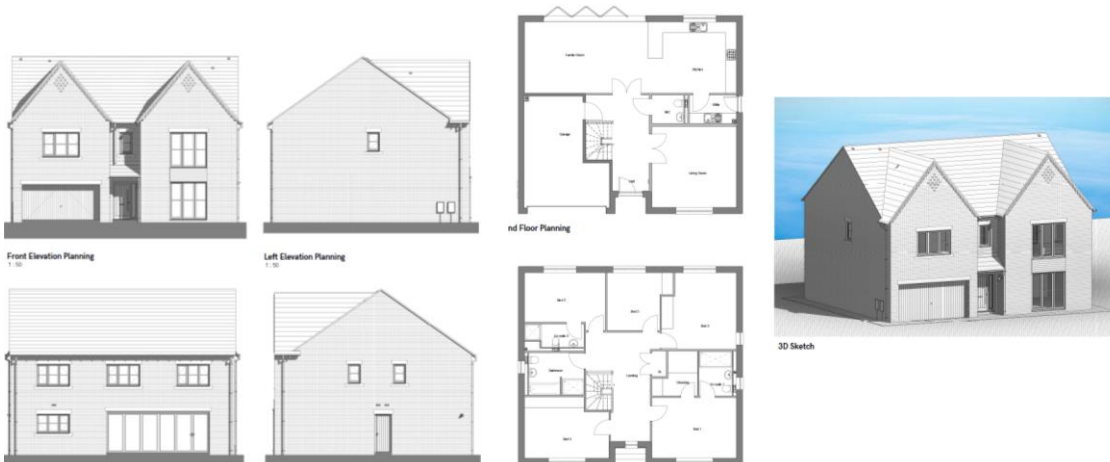
Front Elevation Planning 1:50