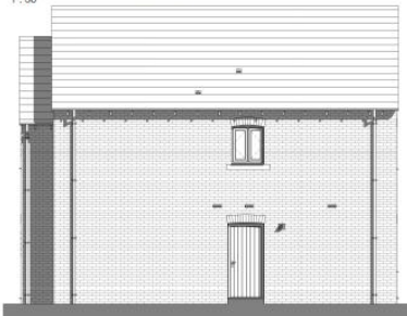
Rear Elevation Planning 1:50