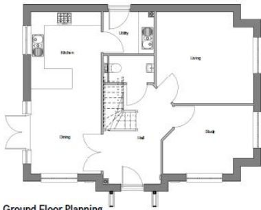
Ground Floor Planning 1:50