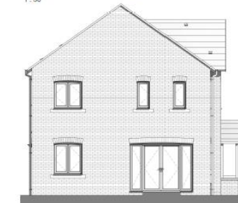
Left Elevation Planning 1:50