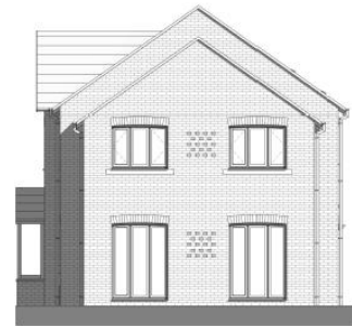
Right Elevation Planning 1:50