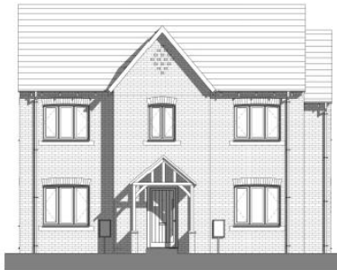
Front Elevation Planning 1:50